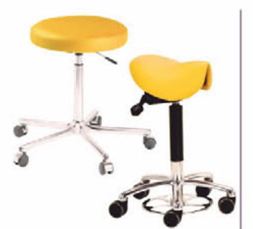
Doctor's mobile chair